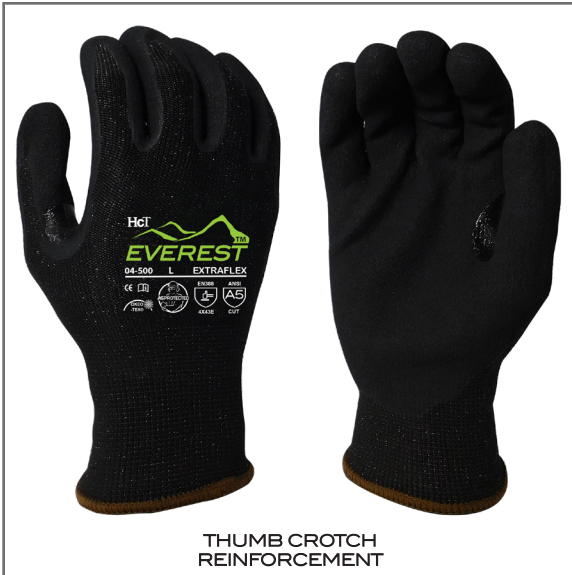
THUMB CROTCH REINFORCEMENT